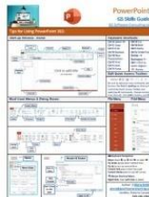
PowerPoint GS Skills Guide