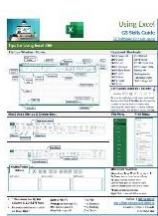
Excel GS Skills Guide

Check-out the GS Course Selector by Job Map