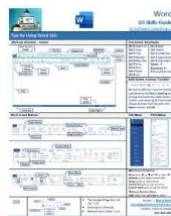
Word GS Skills Guide